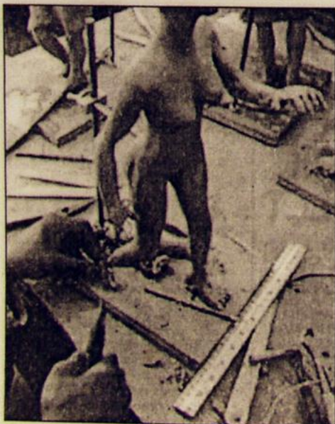
One of Preis' students works on the detail of a woman's figure as part of the Multi-Cultural Sculpture project.

To learn more about the Multi-Cultural Sculpture Project, or to view Erich Preis' own work, visit www.geocities.com/ejpreis . Call 631-271-7646 for information about the upcoming events.